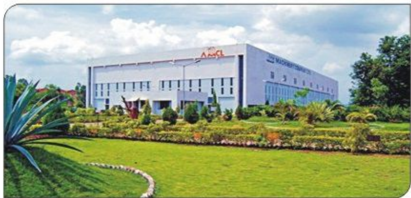
Works at Nagpur

For over four decades, AMCL has been turning the wheels of the Indian Tyre Industry, sourcing advance solutions from World leaders like Leonh Herbert Maschinenfabrik, Germany; Midland Tyre Machinery Co. Ltd., U.K.; Kobe Machinery Co. Ltd., Japan, and KOBE STEEL LTD., Japan. Recognized as the Pioneer in Rubber and Tyre machinery in India, AMCL shall remain the expert one stop source for all requirements of the industry. It stands committed to provide innovative technology advances to the emerging needs of its valued Customers.